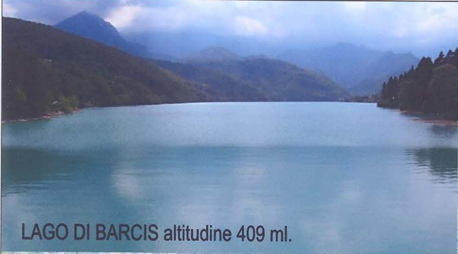
LAGO DI BARCIS altitudine 409 ml.