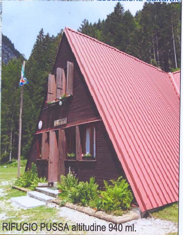
RIFUGIO PUSSA altitudine 940 ml.

DAL LAGO DI BARCIS AL RIFUGIO PUSSA domenica 12 luglio 2009